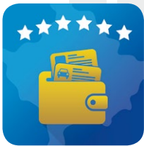
THE RKSmobileID APP ICON

4 | The law enforcement officer will now see the license holder's information on screen to verify the driver's license.